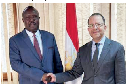
Meeting with the Ambassador of Egypt