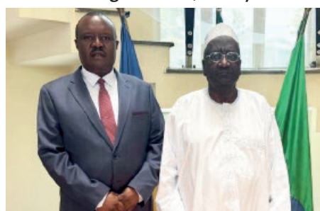
Meeting with the Ambassador of Chad