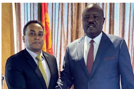
Meeting with the Ambassador of Eritrea