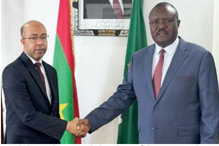
Meeting with the Charge d' Affaires of Mauritania