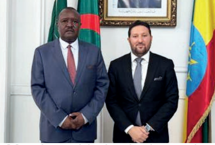
Meeting with the Ambassador of Algeria