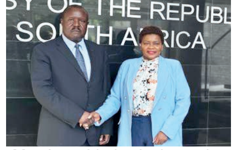
Meeting with the Ambassador of South Africa, Ambassador Nonceba Losi