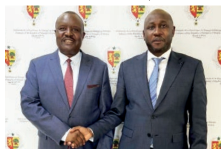
Meeting with the Ambassador of Senegal